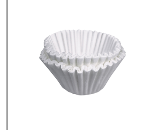
FILTERS, GOURMET 500 500/1 50/CL