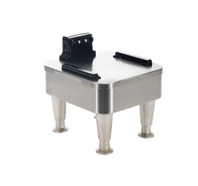
1SH STAND, 120V INF SERIES